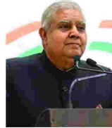
Vice President Jagdeep Dhankhar

New Delhi/Guwahati Vice President Jagdeep Dhankhar on Saturday said the words inserted in the Preamble of the Constitution through an amendment during the Emergency era were a "festering wound", lending weight to the call by a top RSS leader for a review of the added terms 'secular' and 'socialist'.