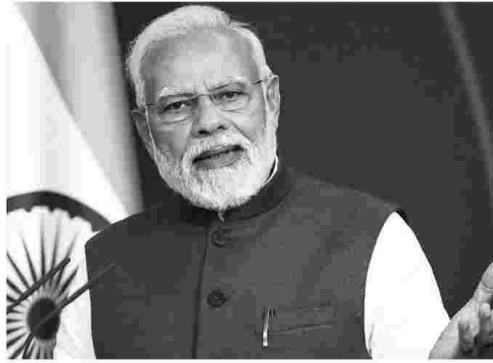
Prime Minister Narendra Modi

"When for ages, efforts were being made to quell violence with violence, then India introduced to