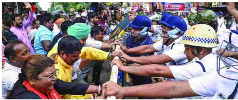
BJP activists clash with police personnel during their protest against the alleged gang-rape of a girl student of a law college, in Kolkata, West Bengal.

Kolkata Kolkata Police on Saturday arrested a security guard of a law college here in connection with the alleged gang rape of a first-year student of the institute earlier this week, an officer said.