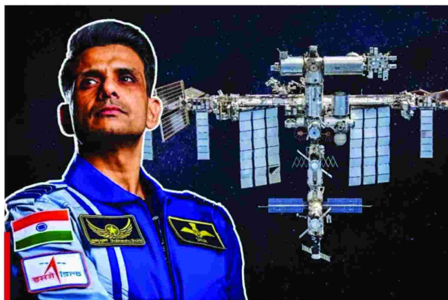
The Axiom-4 mission is a historic moment in India's space history. With the participation of Air Force Group Captain Shubhanshu Shukla, this mission has become not just a technological achievement but a symbol of India's presence on the global stage. This mission, in collaboration with America's Axiom-4 Space and NASA, has taken India to new heights in the field of human space travel. At the level of scientific experiments, international cooperation and strategic partnerships, this mission strengthens the foundation for the upcoming Gaganyaan and Indian Space Station.

of global inclusiveness and partnership.