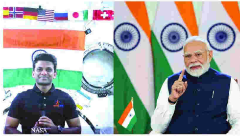
PM interested with Group Captain Shubhanshu Shukla, who is aboard the International Space Station

New Delhi The 'Bharat Mata ki Jai' slogan reverberated on the International Space Station as Prime Minister Narendra Modi told astronaut Shubhanshu Shukla that his space travel marked the beginning of a new era and was the first step towards Mission Gaganyaan, India's own human spaceflight project.