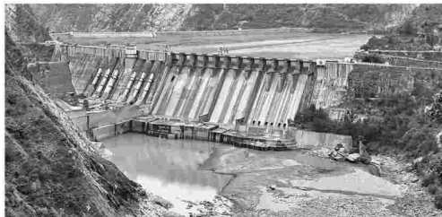
Pakistan said in a statement released early on

The "high priority," at this point, is that "India and Pakistan find a way back to a meaningful dialogue, including on the application of the Indus Waters Treaty (IWT),"